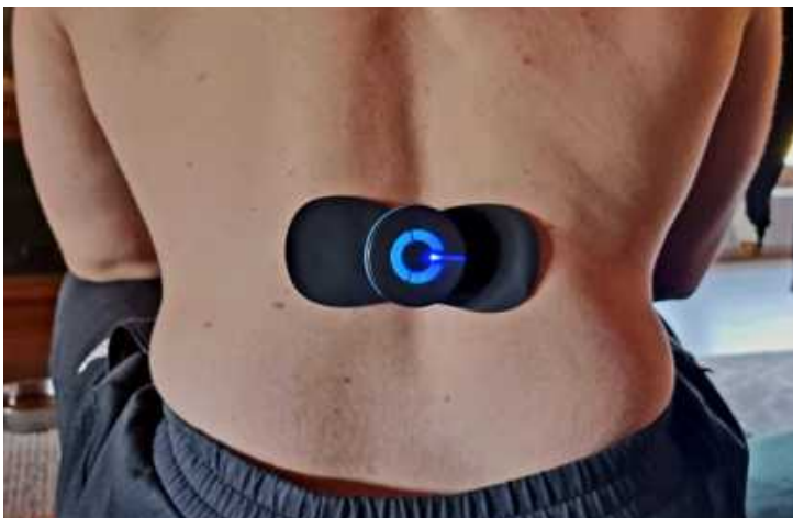
The End of Back Pain: New Device Stuns Surgeons and Changes Lives