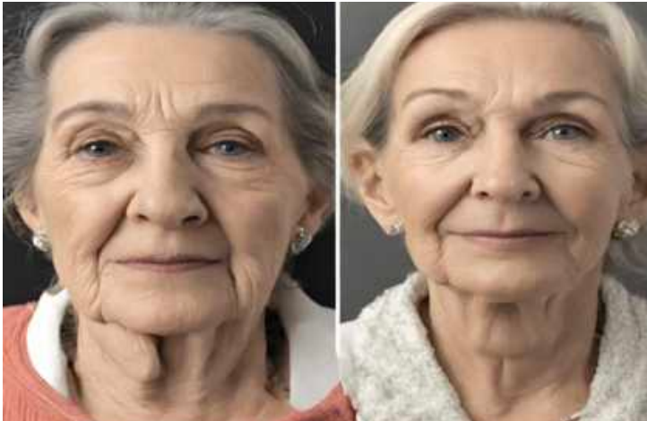
Amazon's #1 Best Selling "Botox in a Bottle"